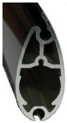
Tear-Drop Anodised Aluminium Bottom Rail

We also offer Stainless steel cables in lieu of the side channels. The stainless steel cables are secured top and bottom by Stainless steel fittings – one inside the head-box, the other secures the bottom end of the cable, by using either an L bracket, which can be secured to a wall or verandah post, or by our Stainless Steel Deck Plate, securing the cable directly to the deck, or flooring etc.