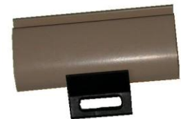
Strap Runner attached to Tear Drop Bottom Rail

One of the highly acclaimed features of the VERTISCREEN range is our tear-drop aluminium bottom rail – again powder-coated to match the other parts of the awning. The cleverly designed end caps used with the newly styled bottom rail can be set in a floating position, or can be re-set to fixed position to always ensure the smooth operation of your awning.