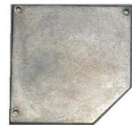
End Section of Vertiscreen Head-Box Sizes, 95mm x 95mm OR 125mm x 125mm

When Vertiscreen is used in-doors, the side guides (either aluminium side channels, or 316 grade Stainless Steel cable), may be dispensed with, and we offer a flush fitting PVC end cap to finish the look of the bottom rail.