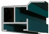
End Section of the Standard Side Channel

When Vertiscreen is used in-doors, the side guides (either aluminium side channels, or 316 grade Stainless Steel cable), may be dispensed with, and we offer a flush fitting PVC end cap to finish the look of the bottom rail.