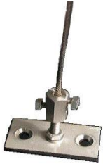
Stainless Steel Deck Plate, Bottom Bush & Cable

Another option we offer is our Wind-Breaker spring package, which is only offered with manual control. This innovative package reduces the load on gear-box teeth, by cushioning the impact of the wind on the fabric.