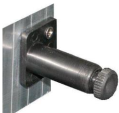
Manual Bottom Rail Lock with Stainless Steel Pin

The VERTISCREEN models have proven extremely popular with architects, builders, home owners and commercial property owners and developers.